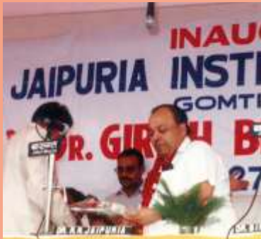
Inaugural Ceremony of Jaipuria LuckNow, 1995