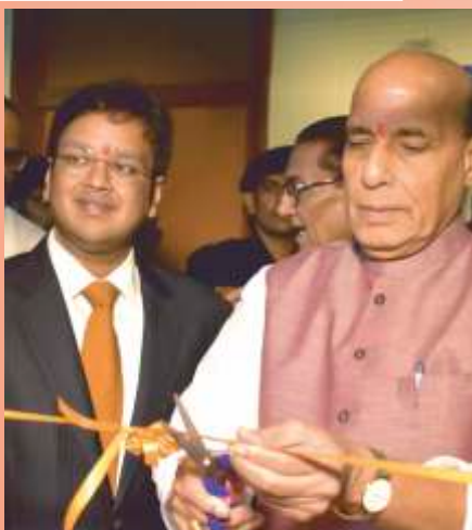
Shri Rajnath Singh Ji, Hon'ble Union Minister for Home Affairs, Government of India inaugurating the Incubation Centre at Jaipuria Institute of Management, Lucknow