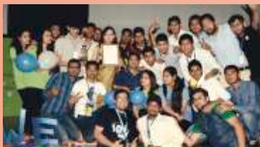
IST INTERNATIONAL TIE UP