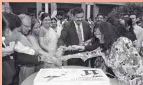
11th Foundation Day Celebration, Jaipuria Jaipur